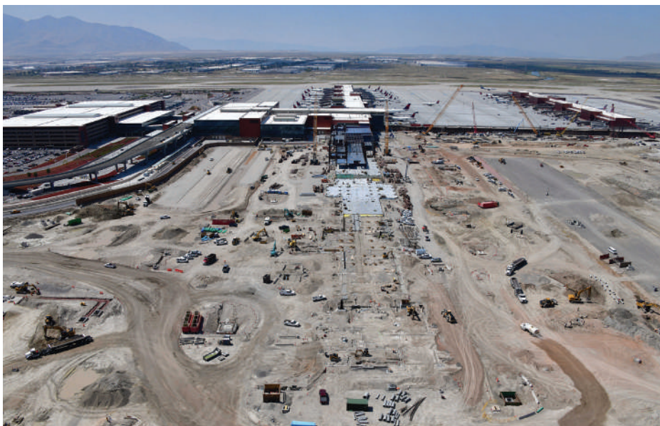
MAKEOVER The two new concourses at Salt Lake International Airport will be linked by an underground tunnel.