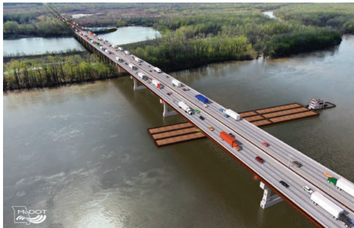
LYNCHPIN New paired three-lane bridges will replace a structurally deficient truss bridge across the Missouri River.

Construction is underway on a $240-million Missouri River crossing for I-70 near Rocheport, Mo. The paired 3,000-ft-long, three-lane structures will replace a 60-year-old, structurally deficient continuous truss bridge that the Missouri Dept. of Transportation calls the “lynchpin of America” because the highway connects the state’s largest cities, St. Louis and Kansas City, and key portions of the U.S. system. The structure currently carries more than 12.5 million vehicles per year, including 3.6 million trucks. To minimize traffic impacts, plans call for the existing bridge to remain in service until the first river span is completed, a milestone the agency expects to achieve by late 2023. The second bridge is scheduled to be ready the following year. Lunda Construction Co. is leading the design-build project, which is being funded in part by an $81.2-million Infrastructure for Rebuilding America (INFRA) grant from the U.S. Dept. of Transportation. Parsons Transportation Group Inc., Dan Brown & Associates Inc. and Hugh Zeng United are providing design services. Safety enhancements planned for the new structures include high-friction surface treatment, pavement sensors, wet reflective striping and a linear delineation system. The project team will also reconstruct the nearby County Route BB interchange. ■