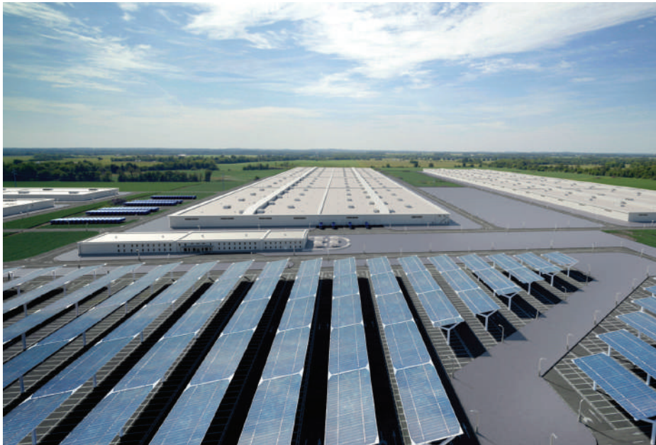
ELECTRIFIED Ford and SK Innovation plan to spend $5.8 billion building two EV battery plants in Glendale, Ky.