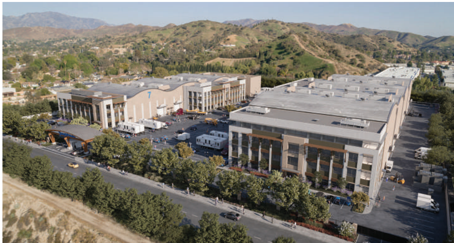
NEW ERA Movie studio construction was sparked by state incentives for California's film and TV industry.