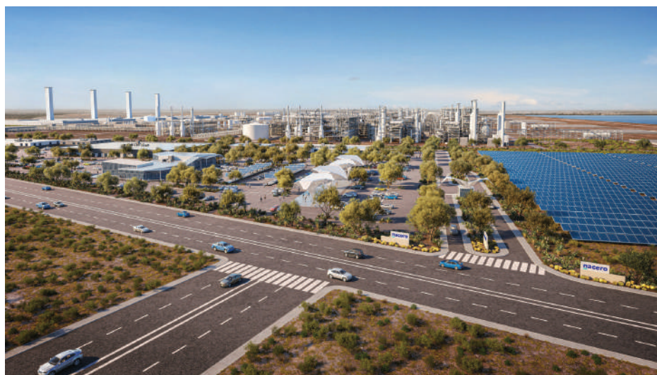
LIFECYCLE Owner Nacero calls the plant the first of its kind to have carbon capture, sequestration and renewable power.

In September, Meridian Energy Group entered into a long-term off-take agreement with Musket Corp. for the transportation of fuels from Meridian's 49,500-barrel-per-day Davis refinery being built in Belfield, N.D. Under the pact, Musket will purchase, market, distribute and resell the Davis refinery output of diesel, estimated at 360 million gallons annually, and of gasoline, about 280 million gallons per year. The facility is the first greenfield refinery to be built in the U.S. in nearly 50 years, according to Meridian. Construction began in 2018, but was delayed by litigation with environmental groups. It is expected to resume in 2022 and completion is expected by 2023. McDermott International was awarded front-end engineering design and EPC contracts on the project.