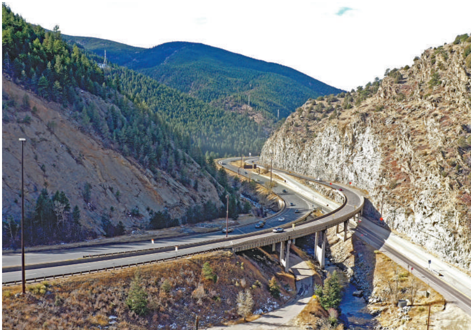
SAFETY Atkins is designing safety improvements to Colorado's increasingly congested I-70 Mountain Corridor.