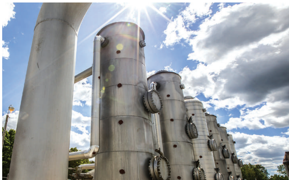
PUMPED TC Energy seeks a $335-million upgrade of its Gas Transmission Northwest pipeline from Idaho to Oregon.

Cameron LNG awarded to engineering firm John Wood Group PLC on June 30 the owner's engineering services contract for a fourth train at its production and export facility in Hackberry, La., on the Calcasieu ship channel. Wood also will provide services to boost production from the existing three trains that now provide 12 million tons per year, the Cameron announcement said. Design of the fourth train, with planned capacity of 6.75 million tons per year, was amended to include use of electric drives that would cut emissions and provide the option of carbon sequestration. The Federal Energy Regulatory Commission said in April it is evaluating project environmental effects. Semptra Infrastructure, Mitsui & Co., Mitsubishi Corp., TotalEnergies and NYK Line are the owners of Cameron LNG. They did not disclose the expansion project cost but said final investment decision was expected in the second half of 2023, when project development work is set to finish.