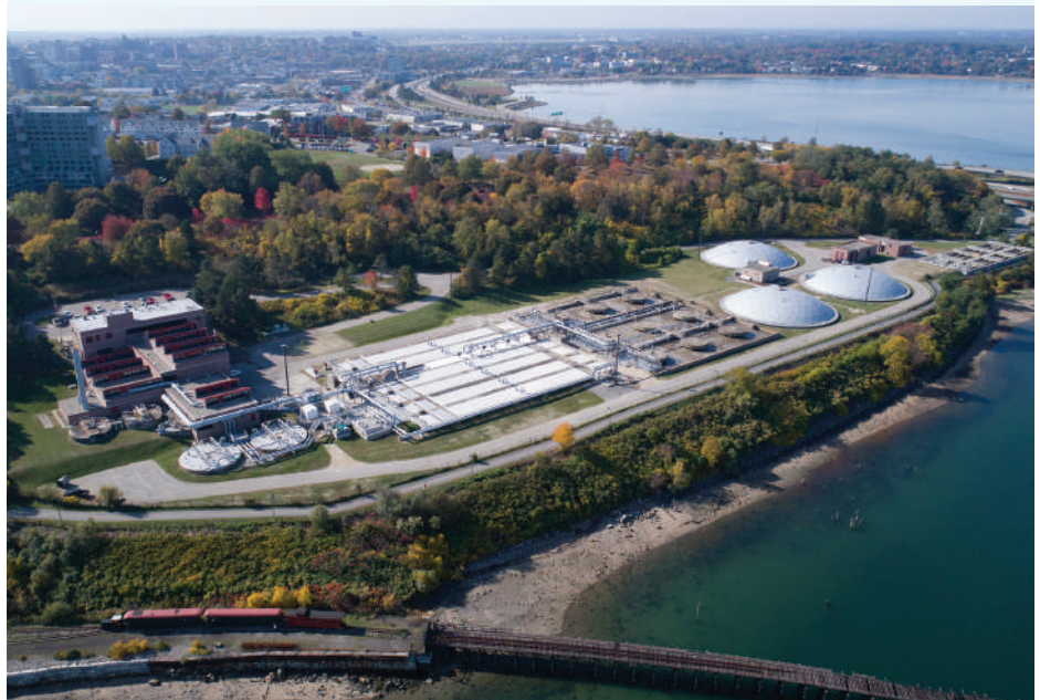
UPGRADES Portland's East End Wastewater Treatment Facility, the largest wastewater treatment plant in Maine, is one of four that will be included in the biosolids masterplanning effort.

B rown and Caldwell announced in June that it had been hired to work with the Portland, Maine, Water District to develop a master plan evaluating current and future biosolids management.